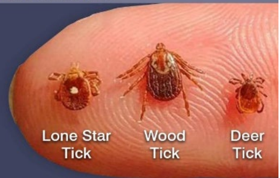
Lone Star Tick